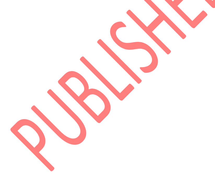
Page 3 Issue No. 1 Published by: Woodford Trailers HSA Speed Championship