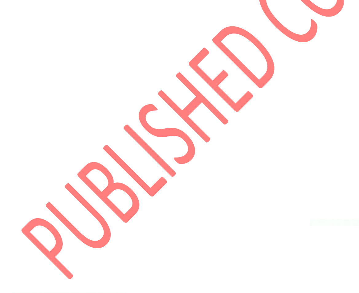
Page 12 Issue No.1 Published by: Woodford Trailers HSA Speed Championship

Motorsport UK are exceedingly concerned of the impact of single-use plastic tyre wrapping and use of these plastic wraps is banned.